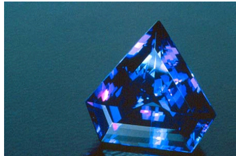
Tanzanite is a versatile gemstone that comes in a variety of sizes and cutting styles. Although once considered only as an alternative to sapphire, it has quickly established itself as one of the premier gemstones in the world.

Edited from several sources including Gemstone.com website.