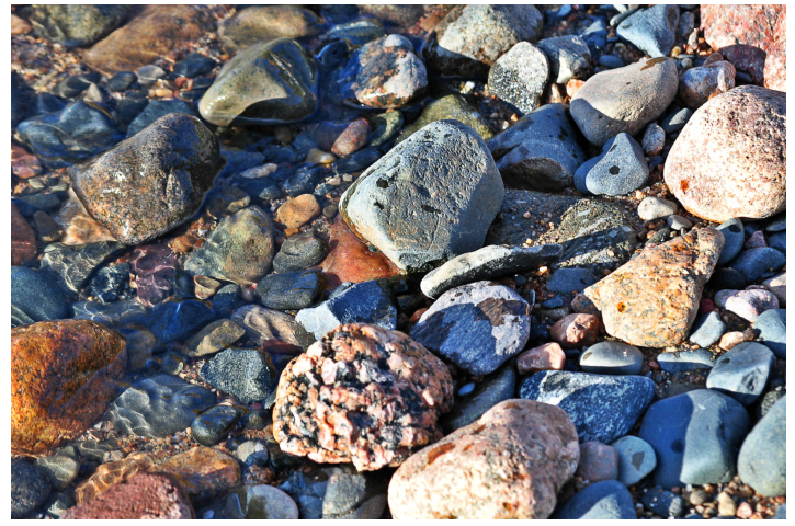
Leech Lake, Minnesota beach material can vary wildly from smooth sandy patches to shores made of rocks and pebbles.

During the last week in September I traveled to Leech Lake, Minnesota to join my siblings and father on a fishing trip near Whipholt. Leech is the second largest inland lake in Minnesota and generally regarded as a championship fishing lake. While the walleye fishing was poor due to changing weather factors including a few seconds of snow, the fall scenery and placid lake views were outstanding as usual.