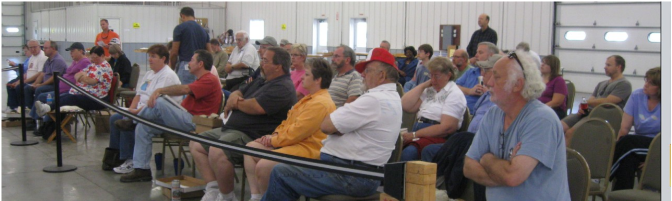
A good crowd gathered and stayed for the whole auction.