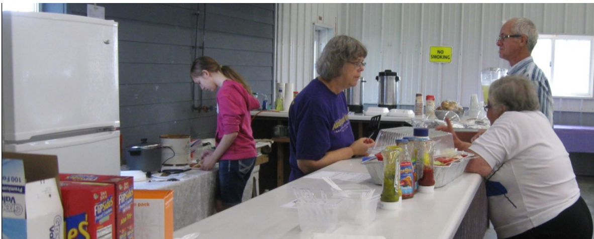
Hot food was available both days.