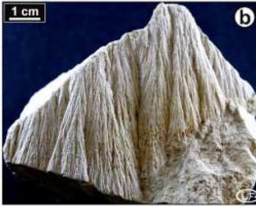
Shatter cones. (a) Exposure view of shatter cones in quartzite from Sudbury structure (Ontario, Canada). (b) Macrophotograph of typical horsetailing shatter cone surfaces (in limestone from Steinheim structure, Germany).

striated fractures that typically form partial to complete cones." The striated surface of shatter cones is either a positive or a negative feature, with the striations radiating along the surface of the cone. Shatter cones usually occur in the central uplifts of complex impact structures (greater than 3 miles in diameter) or as isolated fragments in impact breccias. They are usually found as composite groups of commonly partial to complete cones, with frequently opposite orientations. Thus, shatter cone apex orientation can not be used to determine the center of a crater or its size.