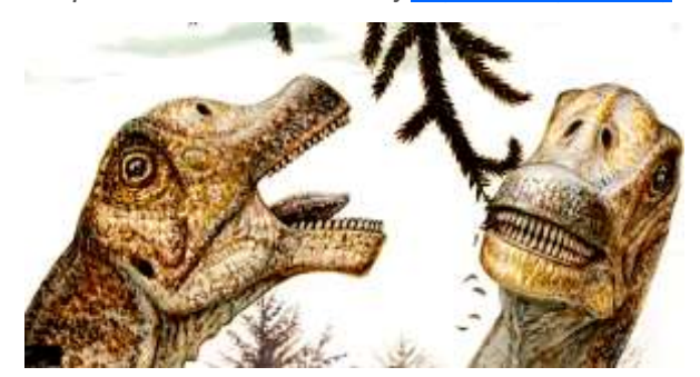
Illustration of Abdyosaurus mcintoshi

Republished from a news release by Brigham Young University.