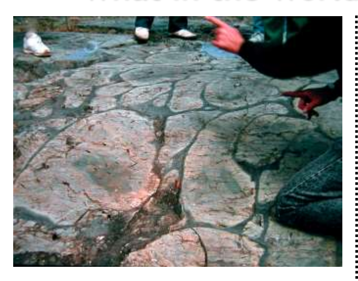
This rock exposure is in Canada, but the structures shown here can be found at many locations around the world. What are they???