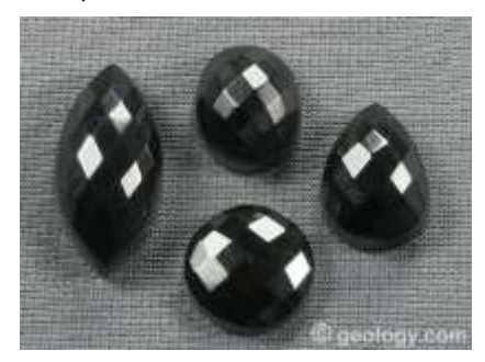
These four stones of faceted jet clearly show how jet can accept a highly reflective polish. <a href="http://geology.com/gemstones/jet/">http://geology.com/gemstones/jet/</a>

Jet is a black organic rock that forms when pieces of woody material are buried in sediment and are coalified. Though very similar to coal, it is less friable. Jet can be cut, carved, and polished to a bright luster. People have used jet for thousands of years to produce gemstones, beads, and many other objects. Jet is one of just a few organic gemstones. It is the material that inspired the phrase "jet black," which means "as black as possible."